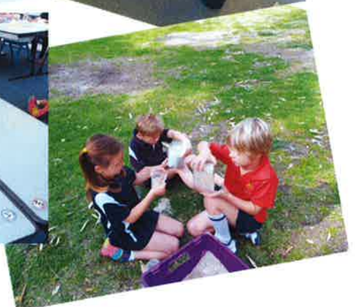
Year 1/2 Discovering Capacity

REMINDER: EARLY CLOSE EVERY WEDNESDAY AT